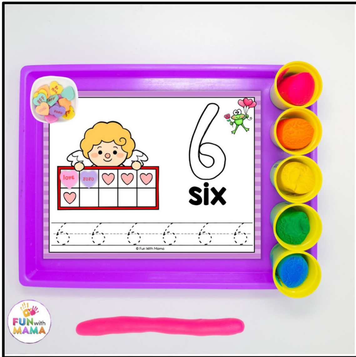
Cupid's Ten Frames