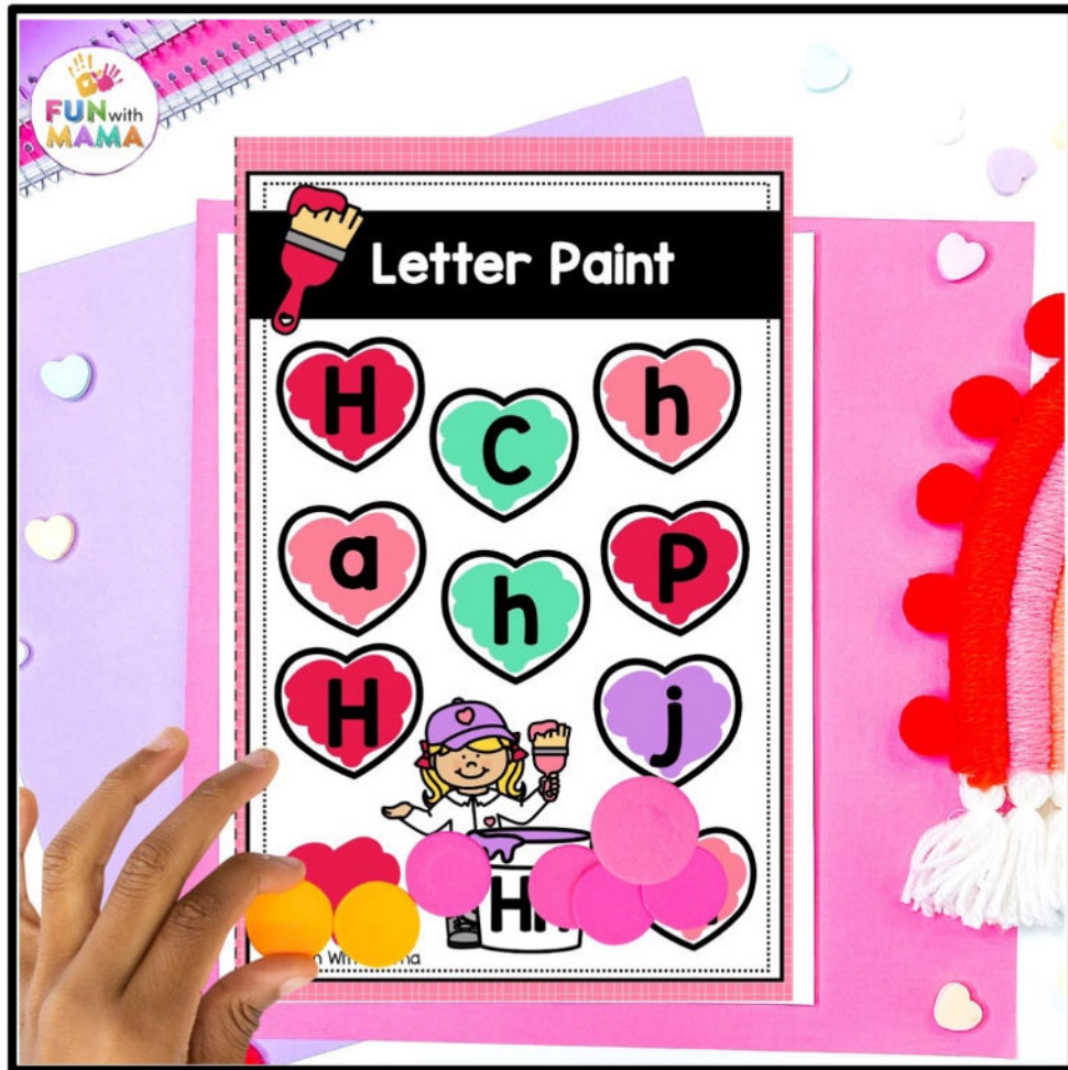
Find The Letter