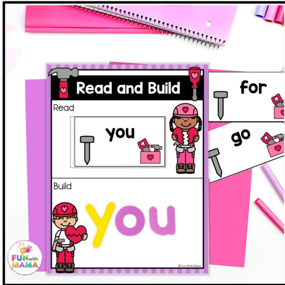
Read + Build Sight Words