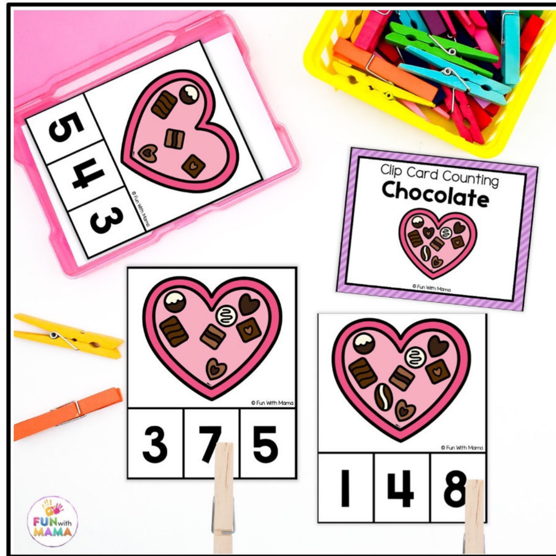
Count + Clip